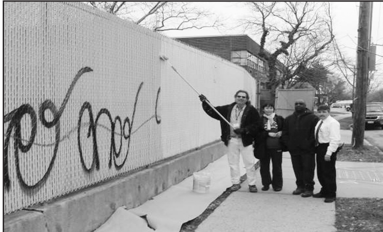
Good Job!! Graffiti clean-up @ Zucker Hillside Hospital 76th ave & 265th street

Graffiti is a sign of lawlessness. If you observe this Crime in progress, call 911. To provide information call 311.